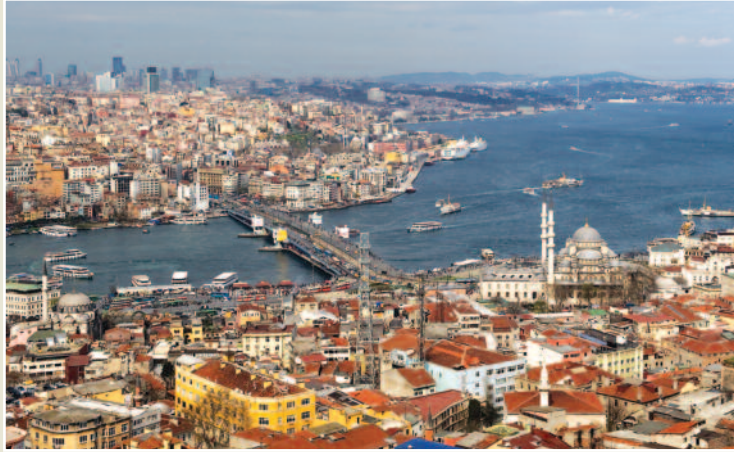
Old City & Bosphorus, Istanbul